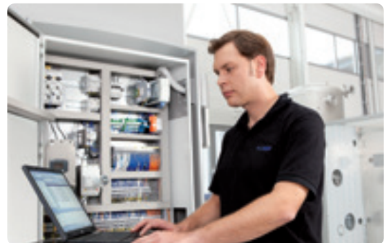
Regular software updates improve performance of your system. Take advantage of cost free software updates, included in our maintenance contracts.