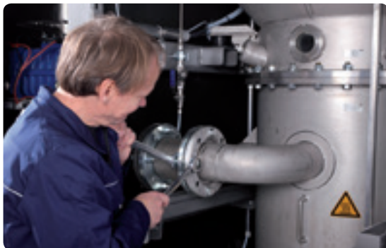
Preventive maintenance increases system availability. Our service technician's expert know how ensures reliability of your VACUDEST vacuum distillation system.

Our offer is complemented by a number of other advantages, such as professional support by our application center for zero liquid discharge and free operator training programs at our main plant in Steinen. In addition, we will contact you automatically whenever system maintenance becomes necessary. You can count on us.